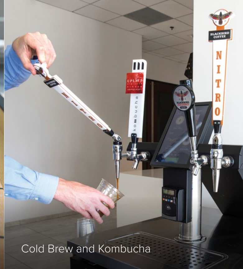
Cold Brew and Kombucha