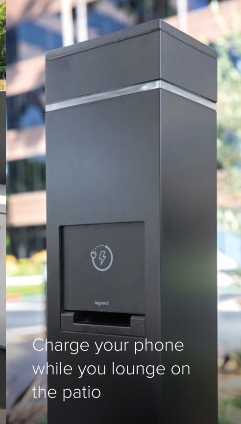
Charge your phone while you lounge on the patio