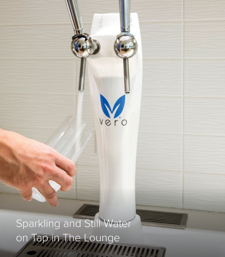
Sparkling and Still Water on Tap in The Lounge