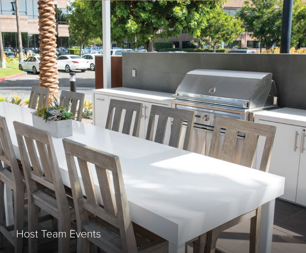
Host Team Events